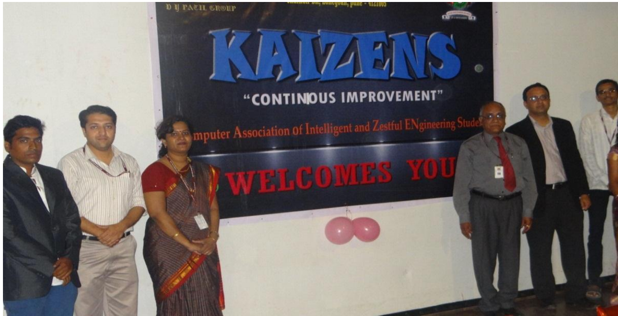
Inauguration of KAIZENS Banner